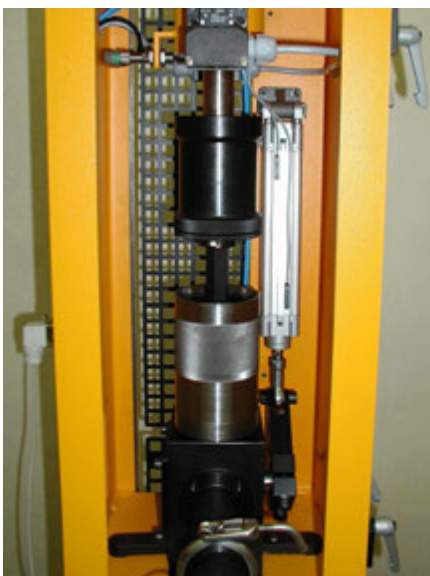
Pneumatic dosing unit

The material to be filled can be fed from a pan press (type S 2-F) or a drum press (type S 6-F). The press will feed the material into the dosing cylinder of the pneumatic dosing unit.