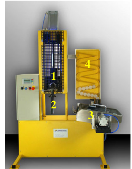
SD-H Version 1 for sealants, adhesives