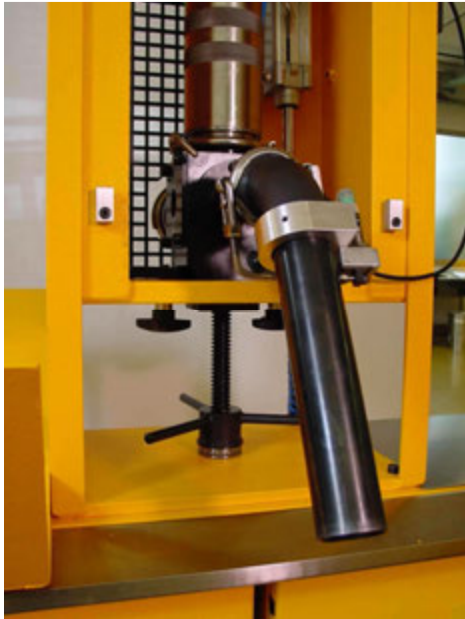
Filling pipe with limit switch