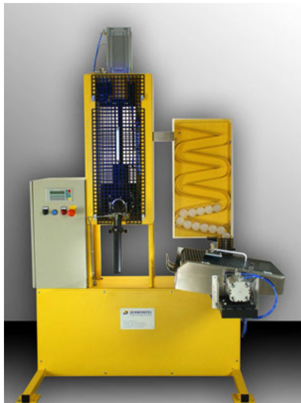
Semi-Automatic Filling and Closing Machine SD-H

for the filling of pasty products and printing inks into cartridges and cans