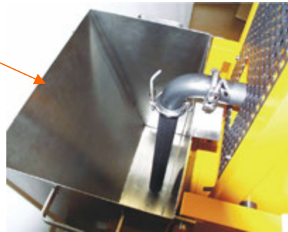
Storage Tank with Suction Pipe