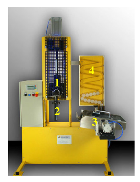
SD-H Version 1 for sealants, adhesives