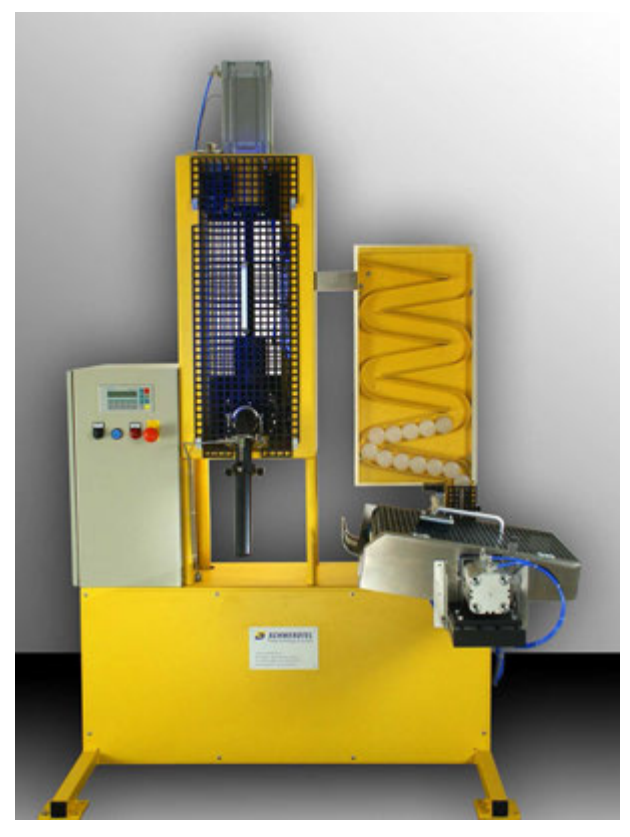
Semi-Automatic Filling and Closing Machine SD-H

for the filling of pasty products and printing inks into cartridges and cans