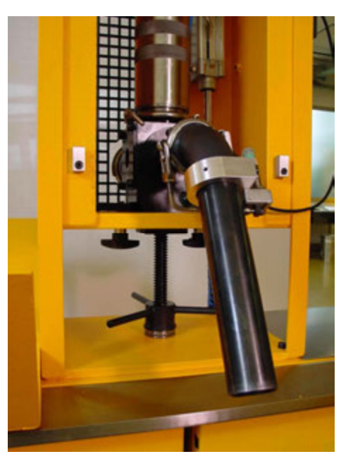
Filling pipe with limit switch