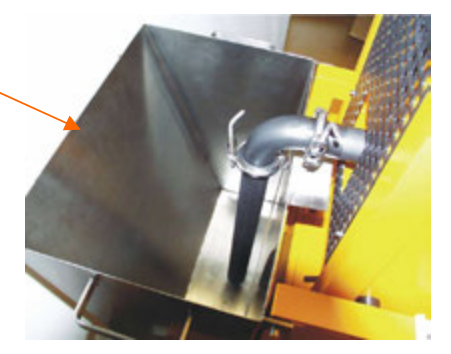
Storage Tank with Suction Pipe