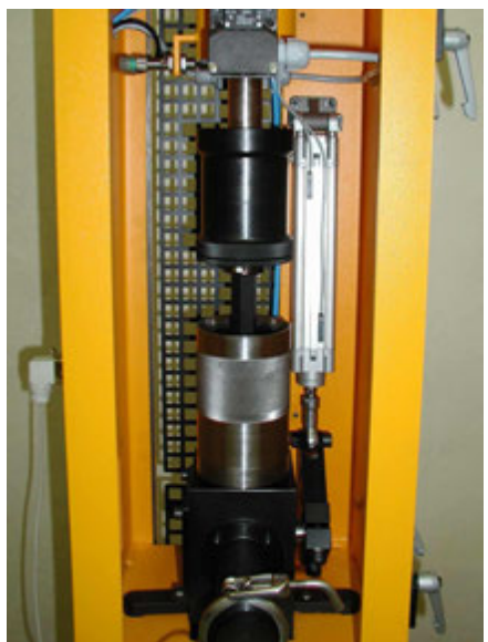
Pneumatic dosing unit

The material to be filled can be fed from a pan press (type S 2-F) or a drum press (type S 6-F). The press will feed the material into the dosing cylinder of the pneumatic dosing unit.